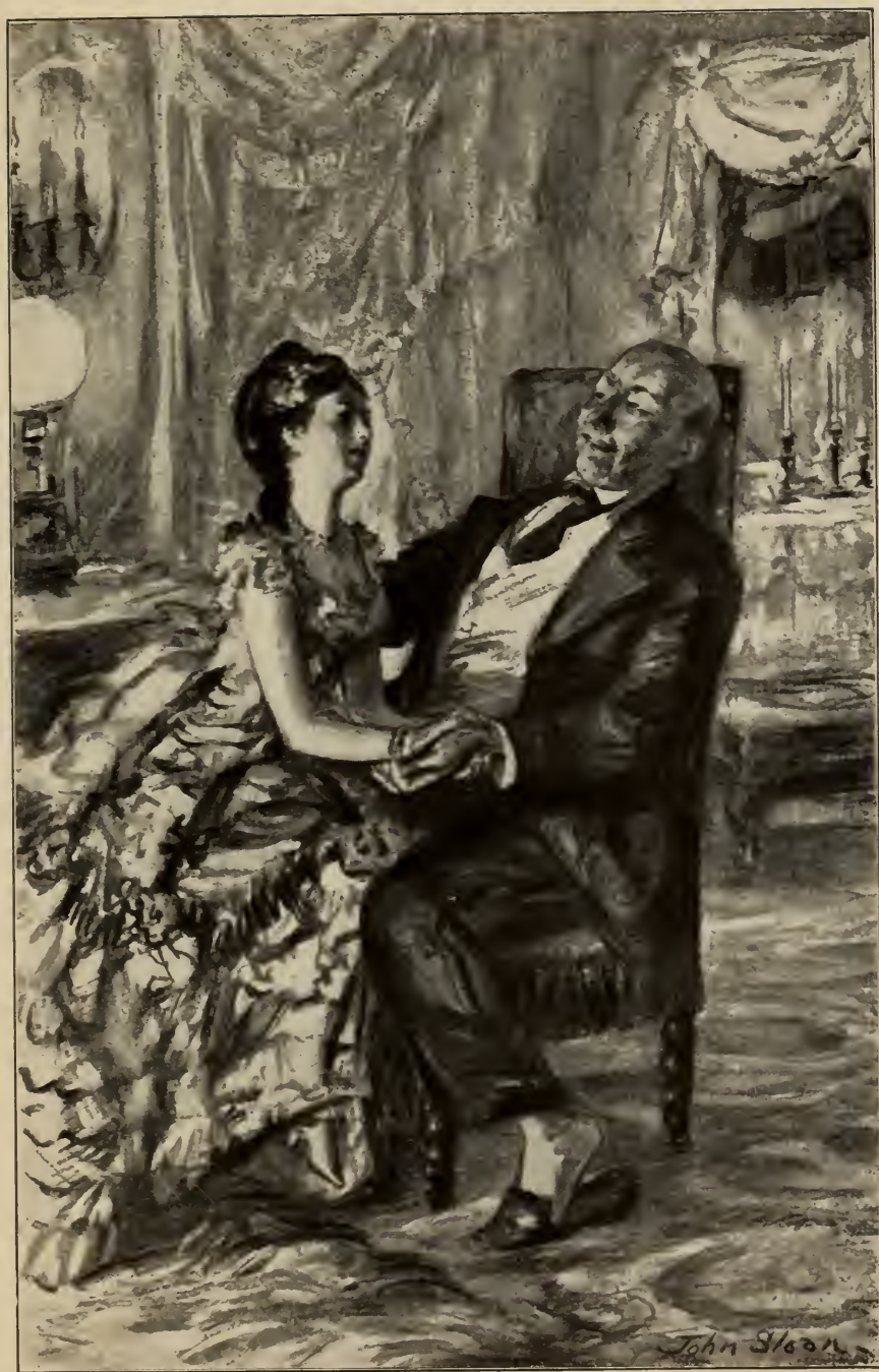
DRAWING HIS DAUGHTER TO HIM, SHE, WITH THE GRACE AND ACTIVITY OF A CAT, NESTLED UPON HIS KNEE